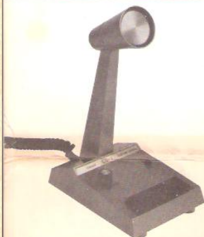
MODEL CS-1 FIGURE 1